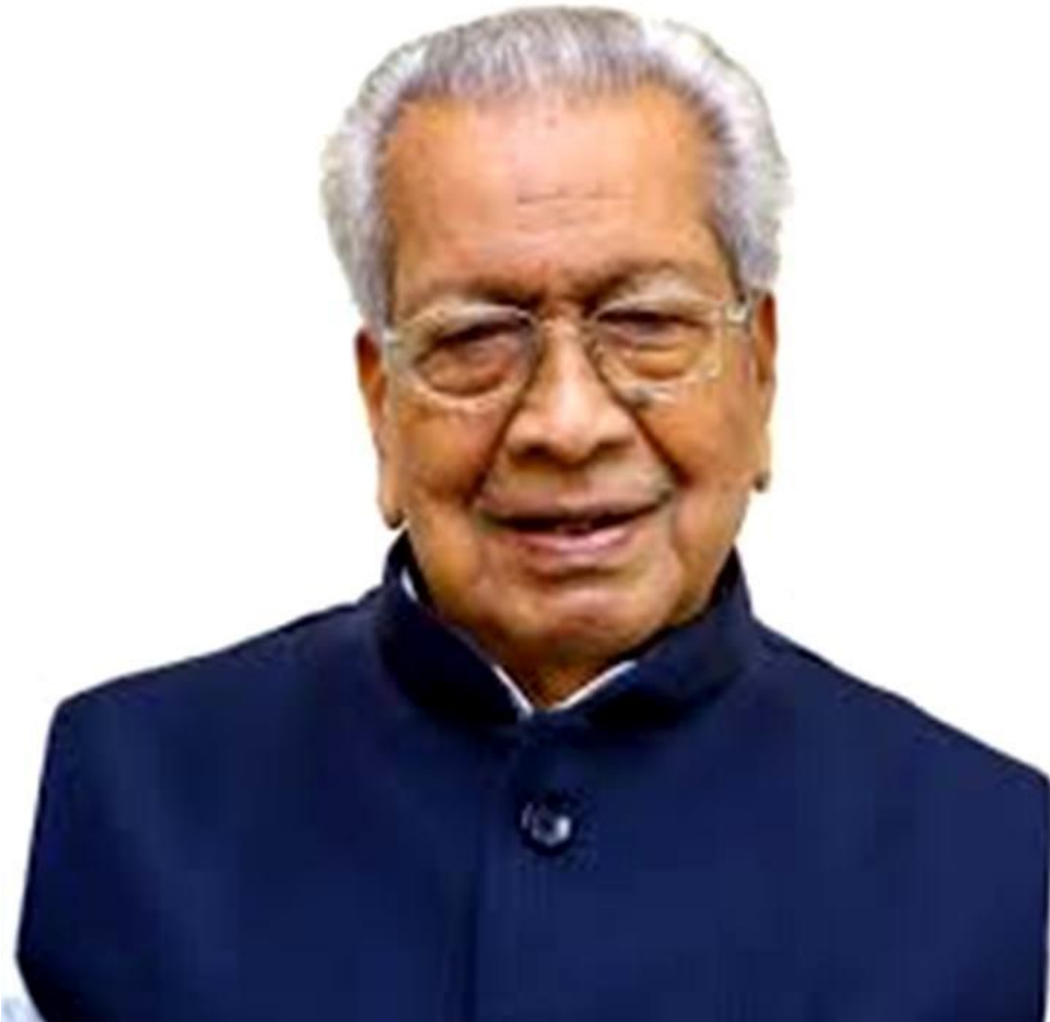
His Excellency Sri Biswa Bhusan Harichandan Governor of Andhra Pradesh and Chancellor